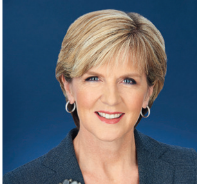
Julie Bishop Minister for Foreign Affairs