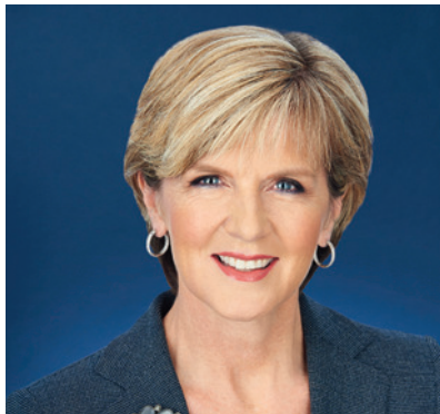
Julie Bishop Minister for Foreign Affairs