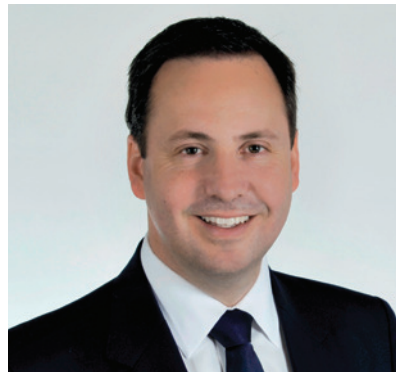
Steven Ciobo Minister for Trade, Tourism and Investment

The 2017 Foreign Policy White Paper sets out a comprehensive framework to advance Australia's security and prosperity in a contested and competitive world.