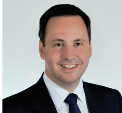
Steven Ciobo Minister for Trade, Tourism and Investment

The 2017 Foreign Policy White Paper sets out a comprehensive framework to advance Australia's security and prosperity in a contested and competitive world.